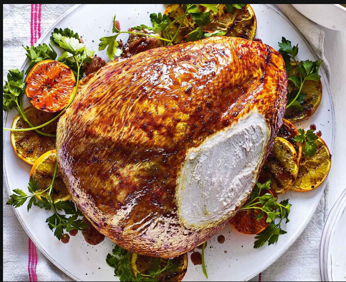
Roasted Turkey crown with vegetables