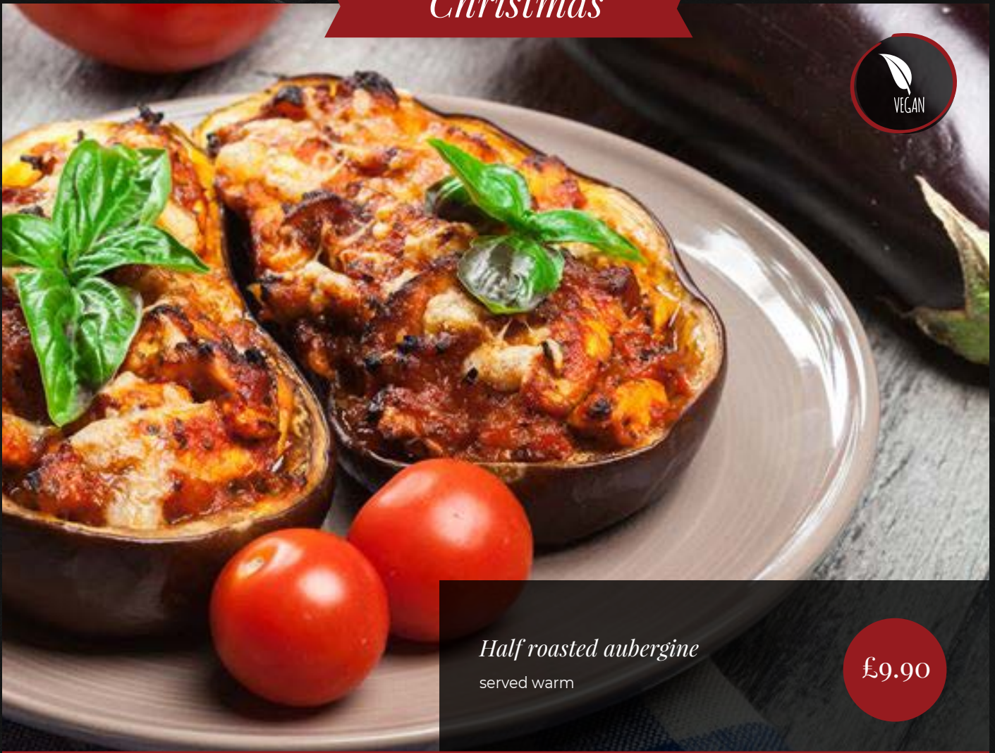
Half roasted aubergine served warm