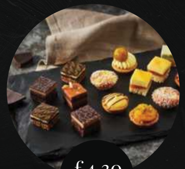
Christmas cake bar slice