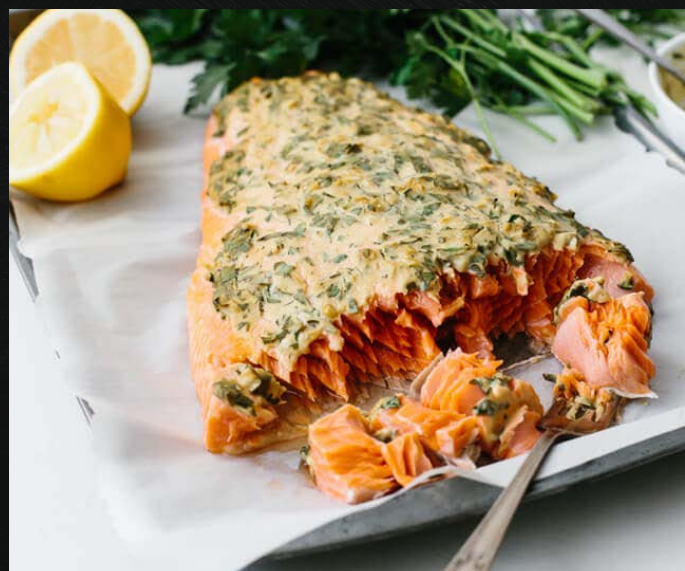
Roasted Salmon with vegetables